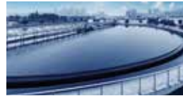
3. Waste Water Treatment