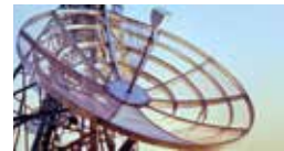
8. Telecommunication Connection