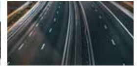
5. Connected Road System and Fully Maintained