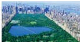
6. Landscape and Housekeeping