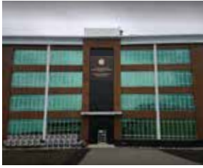
POLYTECHNIC FURNITURE KENDAL