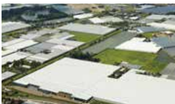
INDUSTRIAL LAND PLOTS