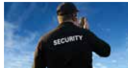
7. 24 Hours Security Patrol