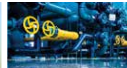
9. Gas Supply