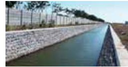
4. Drainage System