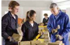
VOCATIONAL TRAINING INSTITUTE