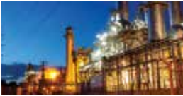
1. Dual Feeder Electricity Supply