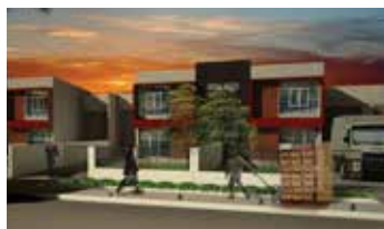
READY BUILT FACTORY