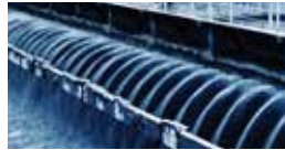
2. Reliability of Water Supply