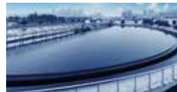
3. Waste Water Treatment