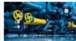
9. Gas Supply