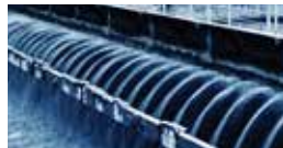
2. Reliability of Water Supply