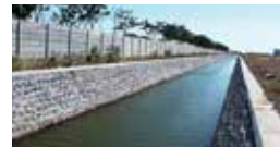
4. Drainage System