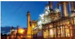
1. Dual Feeder Electricity Supply