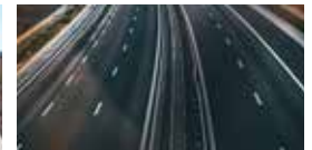
5. Connected Road System and Fully Maintained